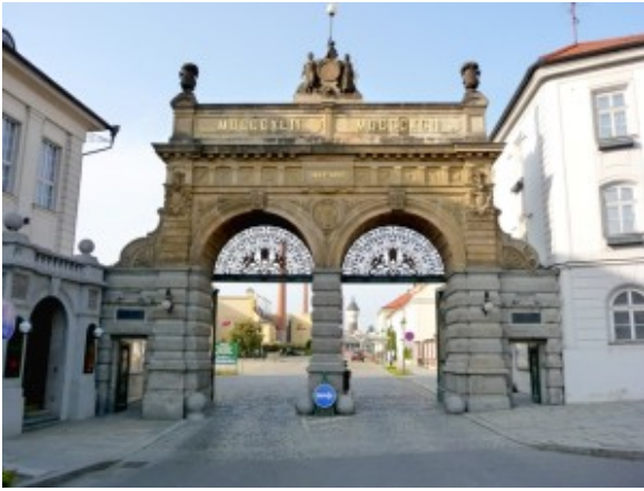
Pilsner Brewery front gate

To be a genuine beer drinker, you should know at least basic facts what makes Czech beer so popular. České pivo is a protected geographical indication (PGI) by EU. It marks out thanks to the use of high-quality ingredients from specified regions, classic technology and procedure of production and of course the craft of Czech master brewers . Especially Žatec region provides the world's best quality hop so essential for brewing. Another essential ingredient is barley for malt , although some brewery may use wheat or other grain.